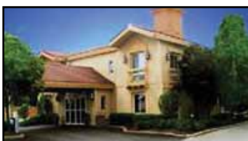
La Quinta Inn Indianapolis East 7304 East 21st Street Indianapolis, IN 46219

Backup Hotels: Both the La Quinta Inn and Fairfield Inn & Suites are located on the Marriott property about half a block from the Marriott. Make sure to make your reservations under the Mobile Riverine Force Association. The Indianapolis Marriott East, La Quinta Inn, and Fairfield Inn & Suites hotels are 21 miles east of the airport.