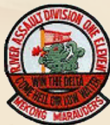
P005 RAD 111

A great gift for any occasion. These sturdy and colorful pins will make a great addition to that special hat. Makes a great lapel pin and tie tack too! Each is quality hand-crafted pewter and comes complete with clasp. Designed exclusively for the MRFA and not available anywhere else!