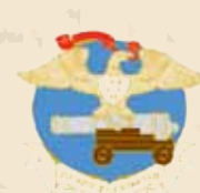
P020 White River