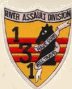
P007 RAD 131