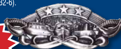
VCCC001 VCCC Pin