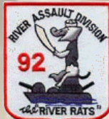
P004 RAD 92