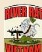
P018 River Rat