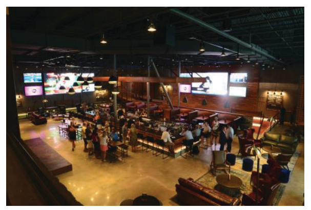
Westport Social – A fun atmosphere, with music!